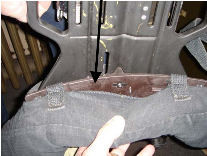
Swivel Lumbar Support