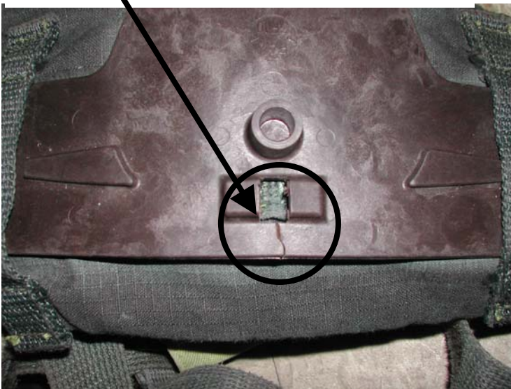
Some Cracks Are Very Apparent