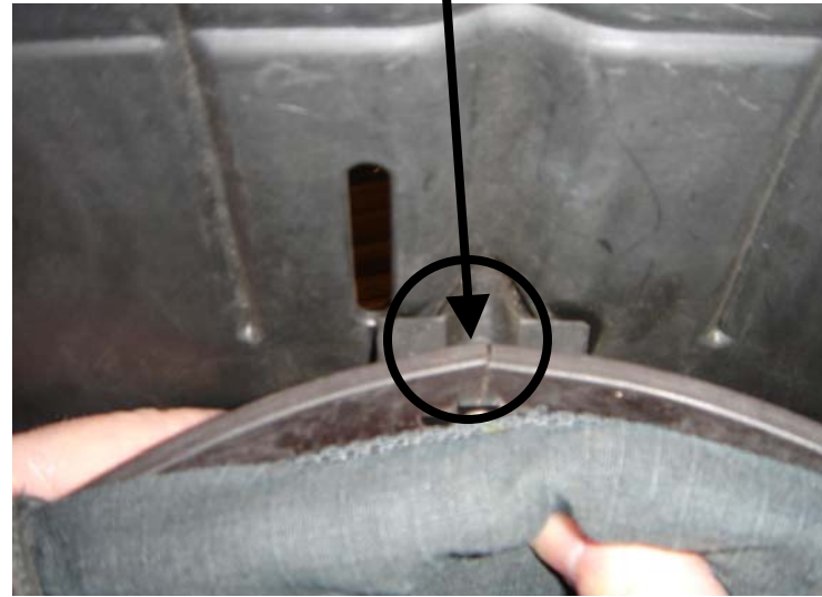
Crack in Swivel Lumbar Support