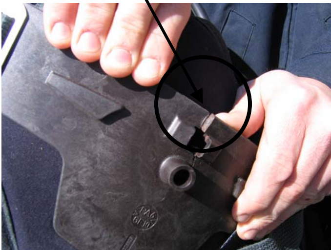
Crack From Pulling & Draging